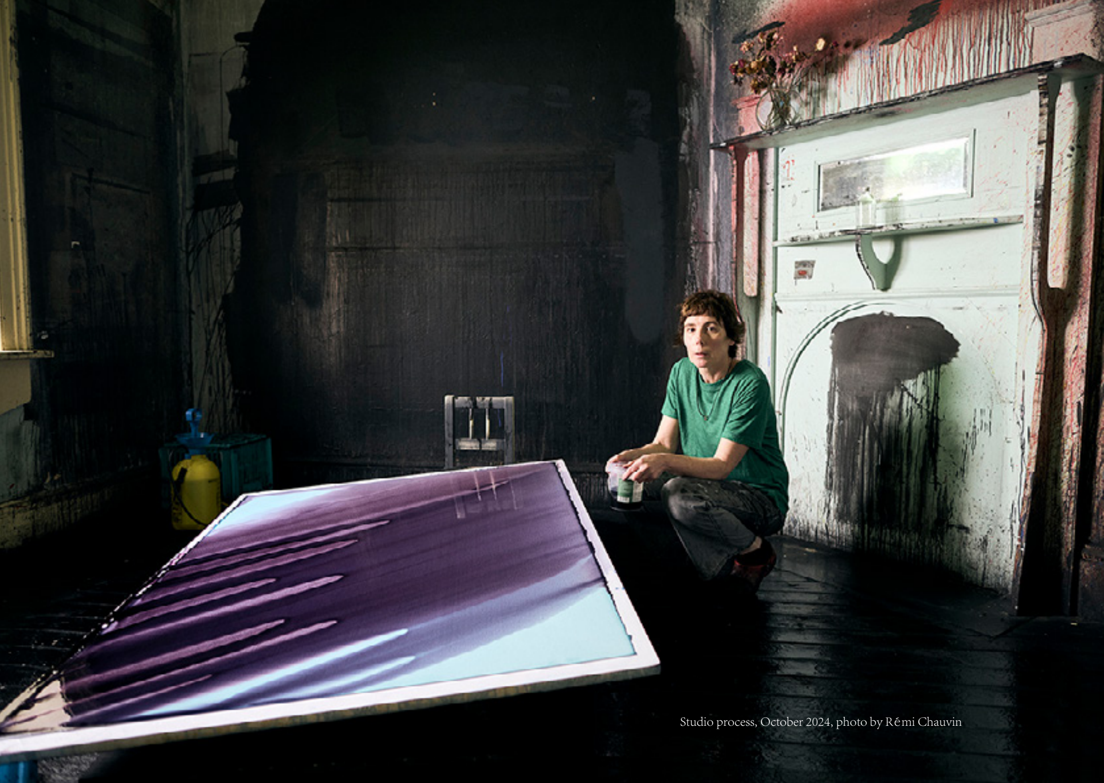
Studio process, October 2024, photo by Rémi Chauvin