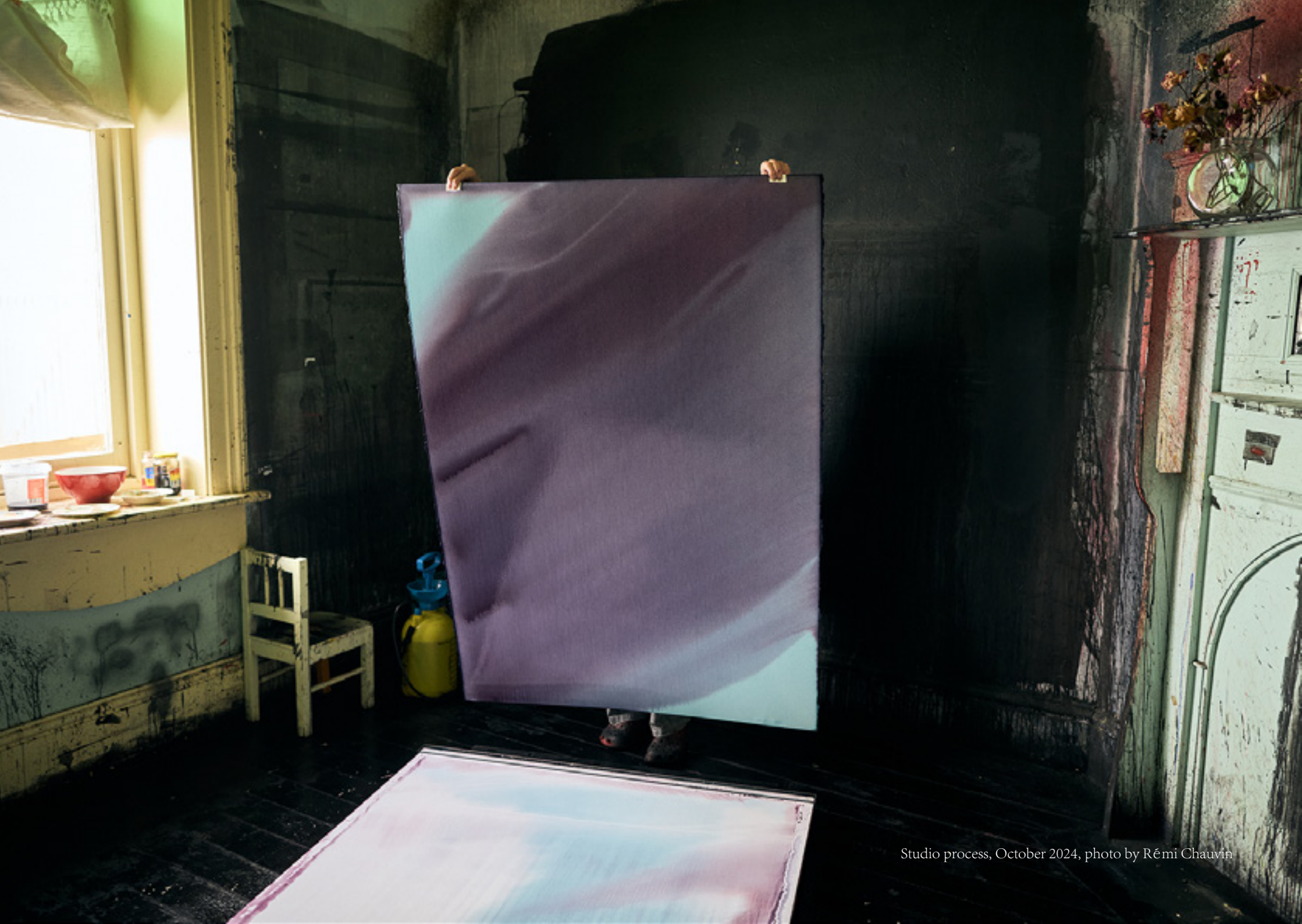
Studio process, October 2024, photo by Rémi Chauvin